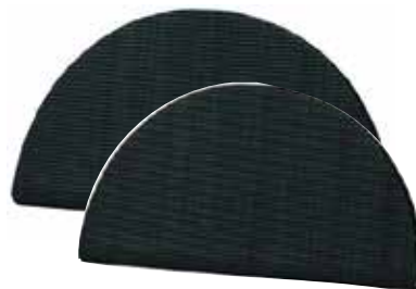
Half-Round Grip Faced Pad 105HPHRG 5" x 1/2" thick 106HPHRG 6" x 1/2" thick Packed 1 ea./1 per case