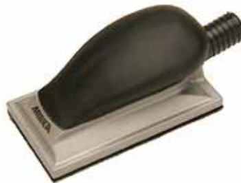
91402 2-3/4" x 5" Abranet Vacuum Block