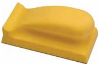
Molded Hand Block 135G Grip Faced, 3" x 5" 135V Vinyl Faced, 3" x 5" Packed 1 ea./1 per case