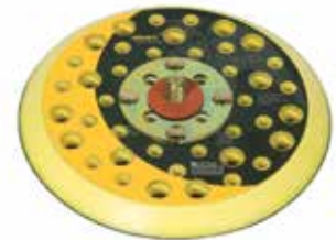
915GV20 5" Abranet® Backup Pad