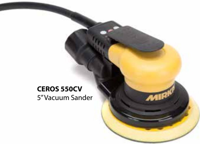
CEROS 550CV 5" Vacuum Sander