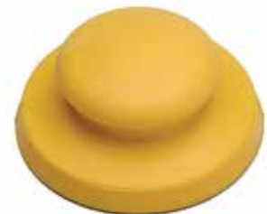
Molded Hand Block 150G Grip Faced, 5" diameter 150V Vinyl Faced, 5" diameter Packed 1 ea./1 per case