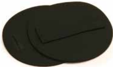
1/8" Hand Pad with Strap 105HP8 Vinyl Faced, 5" diameter 105HPGG8 Grip Faced, 5" diameter Packed 2 ea./1 per case

Available in 5" and 6" diameters, with 3/16" orbit