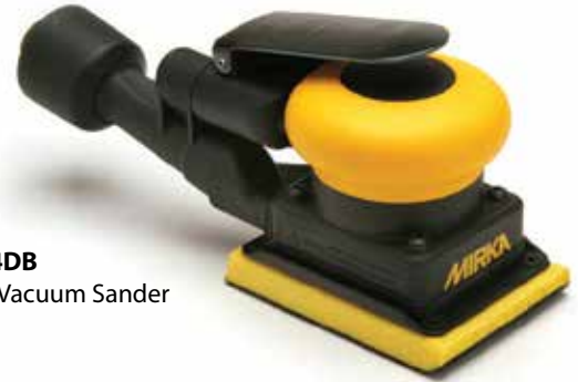
MR-34DB 3" x 4" Vacuum Sander

Available in 3", 5", 6" and 3" x 4" models, in non-vacuum, central vacuum and self-generated vacuum designs.